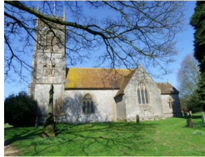
St Mary's Kilmington