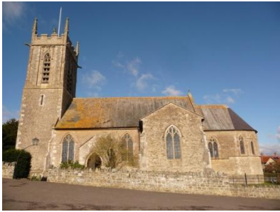
St George's Bourton