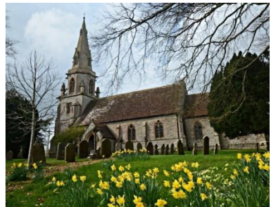
St Martin's Zeals