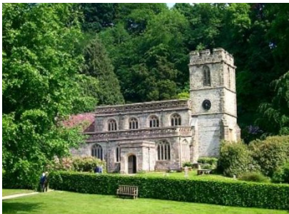
St Peter's Stourton